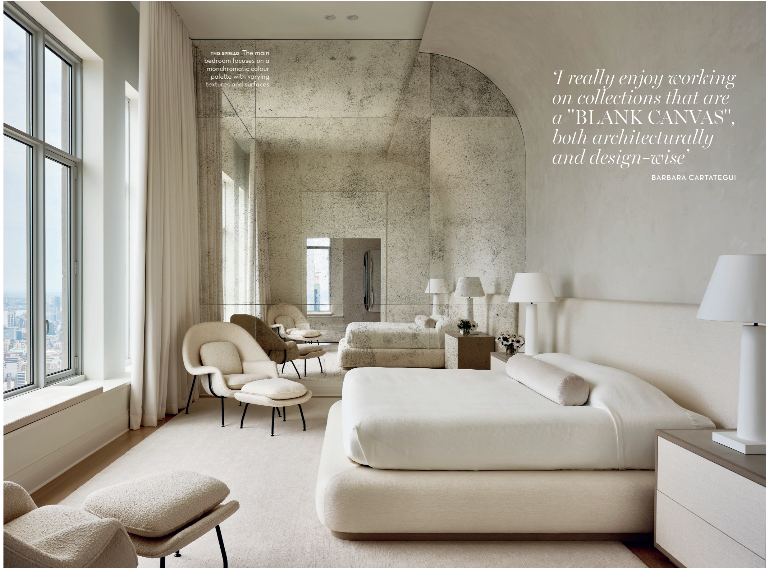
THIS SPREAD The main bedroom focuses on a monochromatic colour palette with varying textures and surfaces