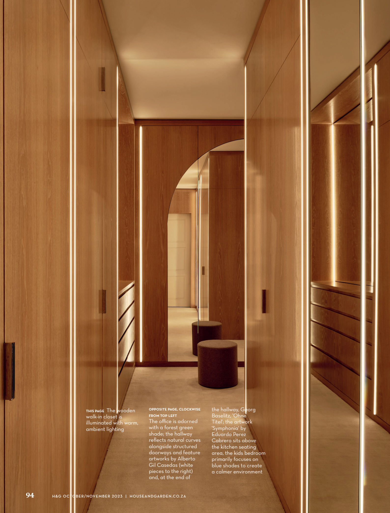
THIS PAGE The wooden walk-in closet is illuminated with warm, ambient lighting