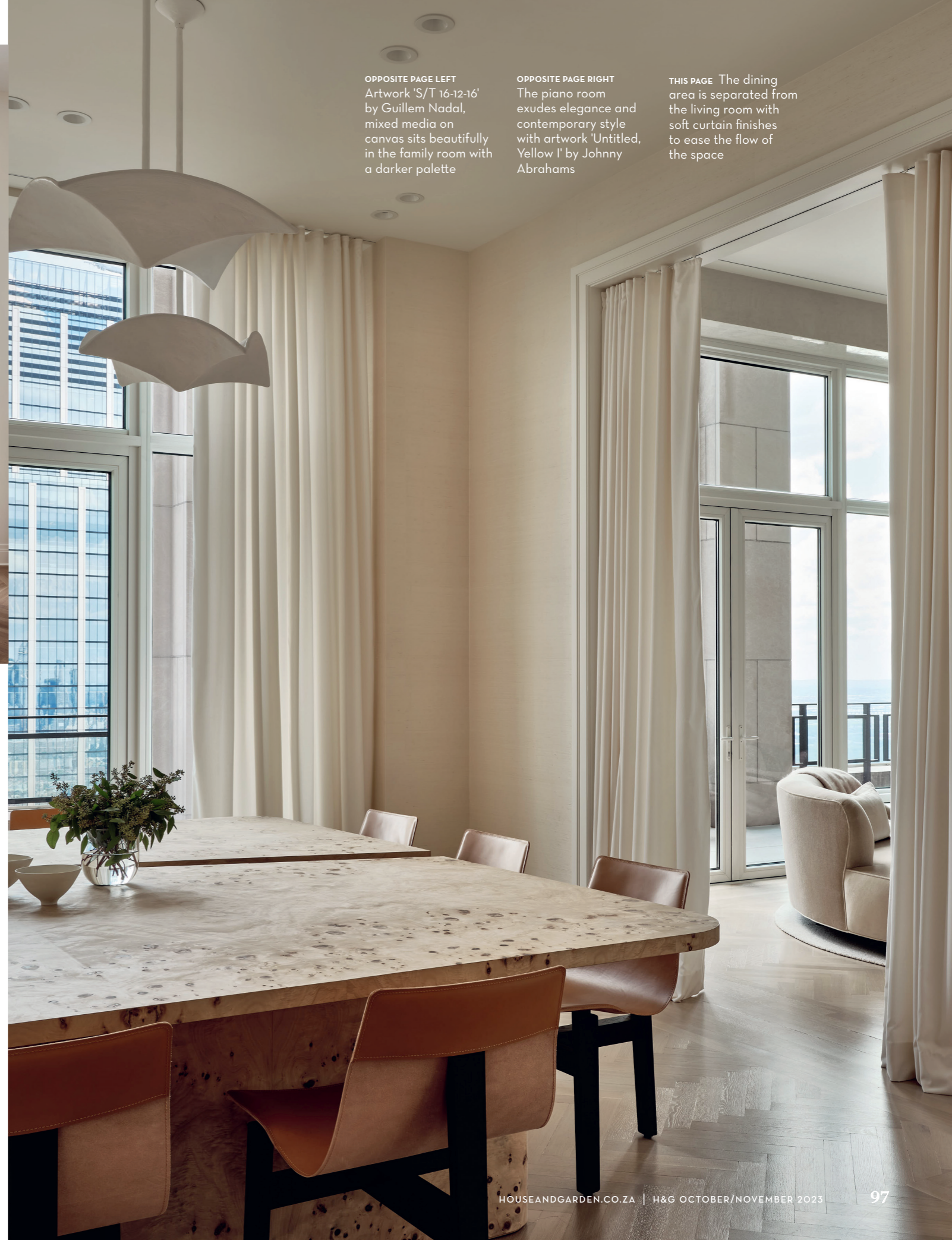
OPPOSITE PAGE LEFT Artwork 'S/T 16-12-16' by Guillem Nadal, mixed media on canvas sits beautifully in the family room with a darker palette