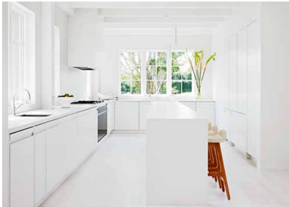
Above: In the kitchen, the counter stools are by Inmod; the refrigerator, under-counter refrigerator, wine refrigerator, and ice maker are all by