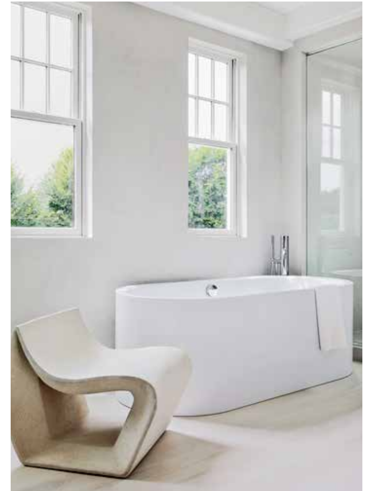
Hardware. Right: In the primary bathroom, the Meisterstück Centro Duo tub is from Kaldewei and the Wirth chair is from Jayson Home.