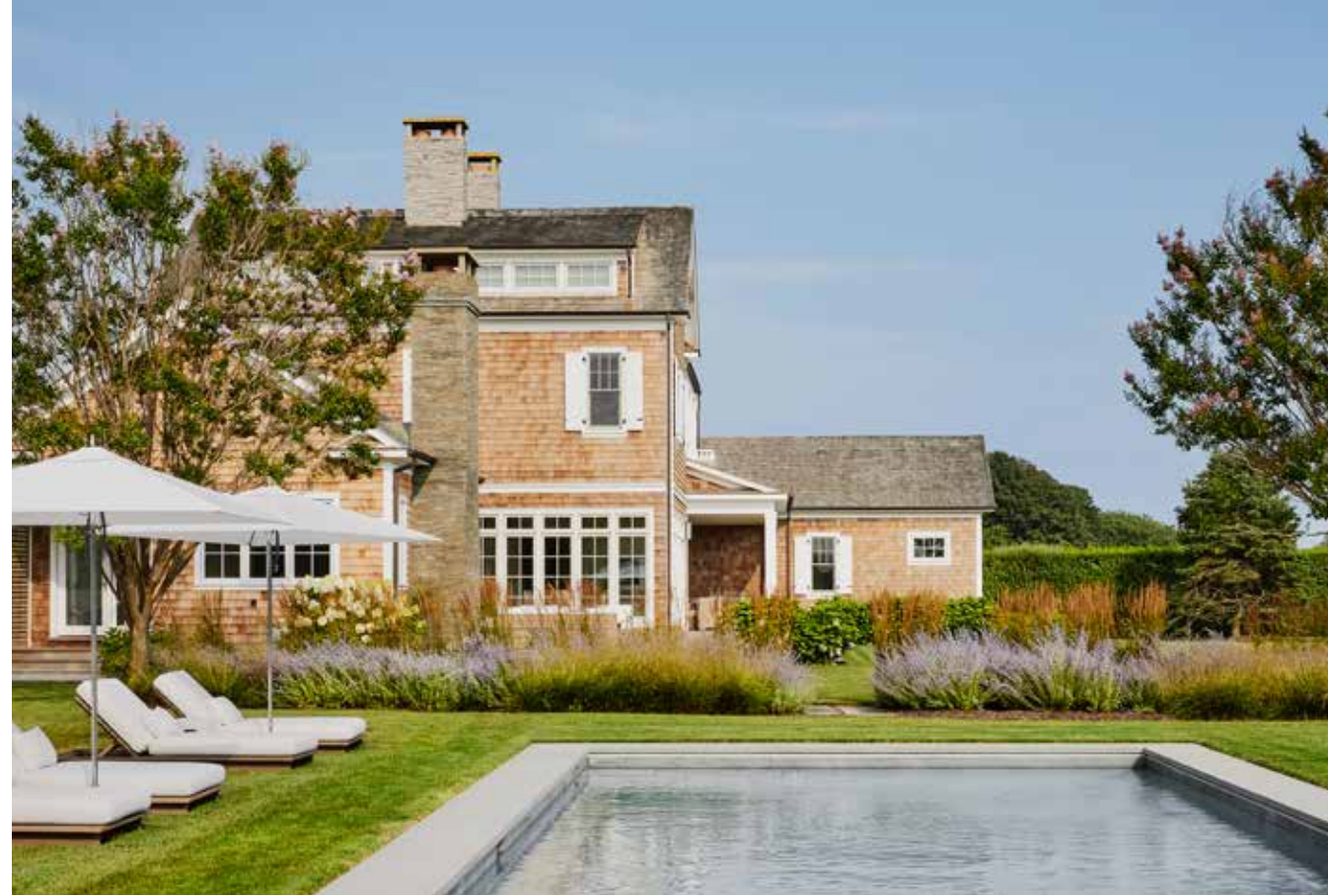
Above: The Ocean Master Classic umbrellas are by Tuuci from Casa Design Group and the Maldives chaises are from Restoration